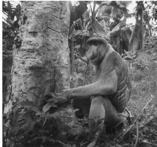
Plate 1 Male proboscis monkey in illegal private captivity (September 1996,).

In 1996, the Governor of South Kalimantan and the Director General for Forest Protection and Nature Conservation also assessed the situation and promised further research. Short-term conservation measures were suggested, including the provision of leaves to the