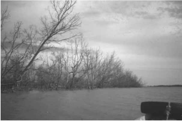
Plate 2 Former prime proboscis monkey Nasalis larvatus habitat on Pulau Kaget (November 1996).

monkeys and the planting of some 5000 Sonneratia sp. seedlings, an important food source when fully grown. In the longer term, plans were put forward to downgrade the status of the area to a Wildlife Reserve, which would allow for other resource use besides conservation.