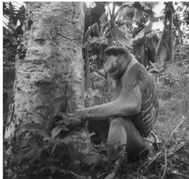
Plate 1 Male proboscis monkey in illegal private captivity (September 1996,).

In 1996, the Governor of South Kalimantan and the Director General for Forest Protection and Nature Conservation also assessed the situation and promised further research. Short-term conservation measures were suggested, including the provision of leaves to the