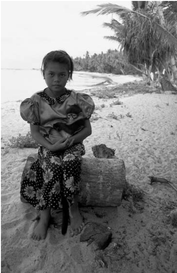
Plate 1 Natuna leaf monkeys Presbytis natunae make popular pets on the island of Bunguran and would be an ideal flagship species for the promotion of wider biodiversity conservation (photo M. Lammertink).

Natuna leaf monkeys are rarely hunted, as they are not perceived as pests, nor are there any indications that they are hunted to obtain valued bezoar stones (visceral secretions found in some species of Presbytis that are used in traditional medicine and are highly priced). Five Natuna leaf monkeys were found held as pets by villagers or local government officials (Plate 1). We looked for pets only in the main populated area around Ranai and Ceruk; in all likelihood more pets were held on the island, but extrapolations are not possible because we do not know how many households were covered by the networks of informants who told us of pets. Three of the pets were juveniles of 1–12 months of age and two had reached near-adult size. According to the people interviewed juveniles can be reared as pets, but captured adults can also be held in captivity and become relatively tame. The lifespan of these pets is usually <1 year for juveniles, but longer for individuals captured as adults. Most monkeys are captured haphazardly near settlements or in forest gardens (a forest